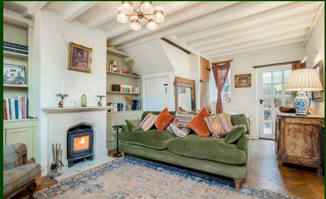
1 Church Street Charlbury Oxfordshire OX7 3PW Telephone: 01608 811146